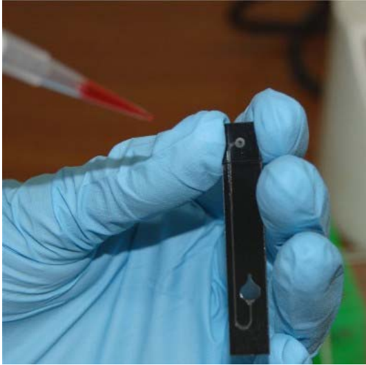
Hold the FluoroVette as shown using a 20-200uL pipetter and standard tip