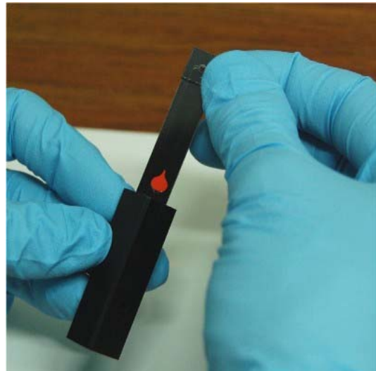
Insert FluoroVette into universal adapter With the inlet side of the FluoroVette facing the excitation side of the adaptor