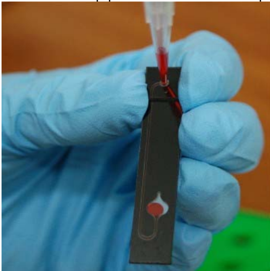
Slowly dispense sample into FluoroVette The FluoroVette sample volume is 50µL