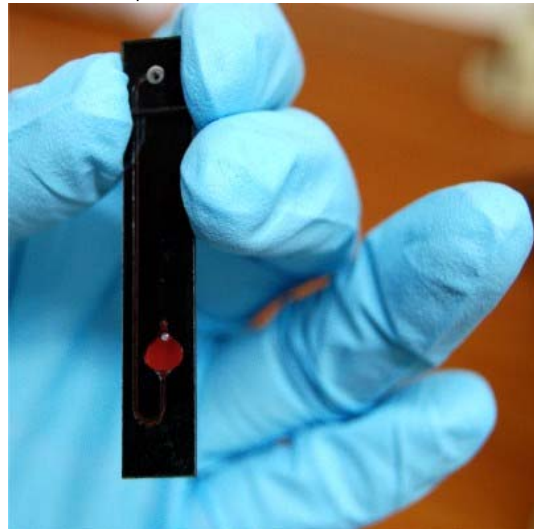
Bubble trap properly removes air deposits