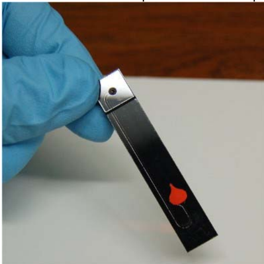
FluoroVette ready for measurement With the inlet side of the FluoroVette facing the excitation side of the adaptor